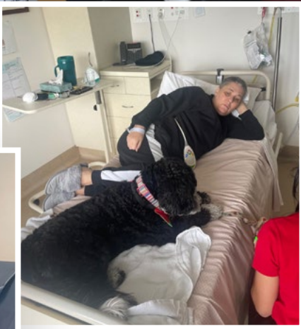
Popcorn visiting patients and staff

Mercy Health’s therapy dog program will be expanded to Werribee Mercy Hospital in coming weeks, with thanks to Wyndham Health Foundation.