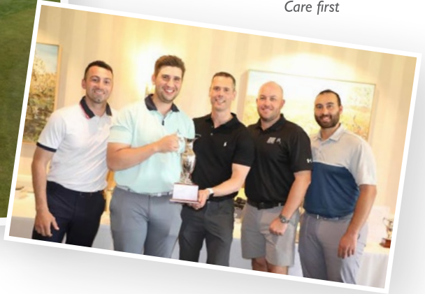
The winning team from VAC Facility Services